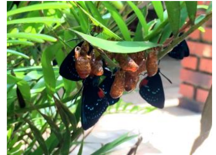
Atala Butterfly and Chrysalis