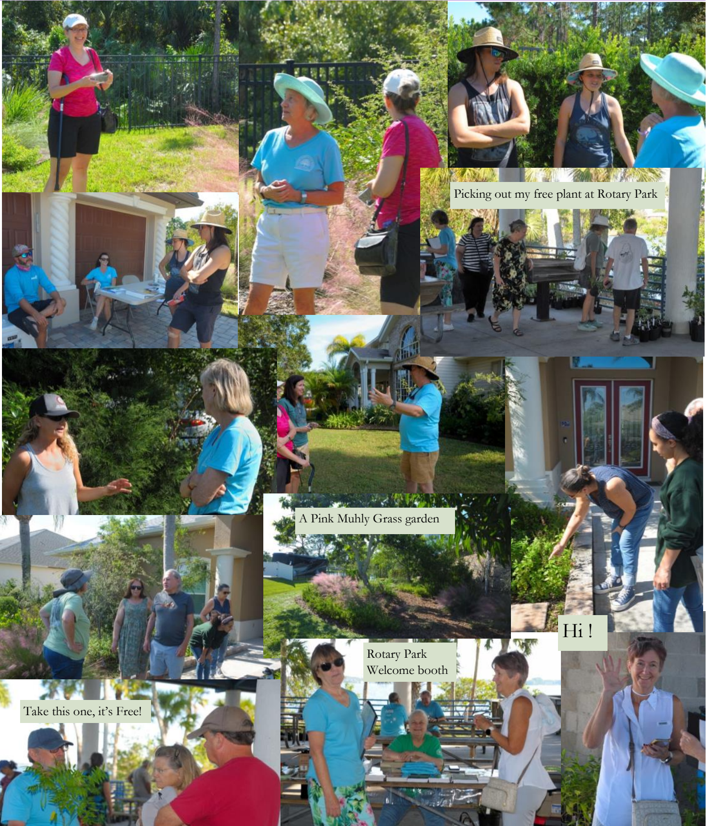
Picking out my free plant at Rotary Park