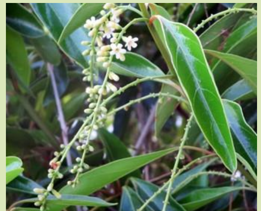
Fiddlewood (Citharexylum fruticosum)

Evidently Fiddlewood consists of hard, heavy, strong wood that has been used for the manufacture of violins, guitars and other musical instruments. Play a little tune and plant Fiddlewood in your landscape. Plant native!