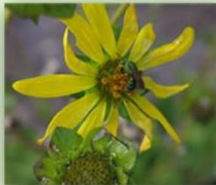
Metallic bee on Lakeside sunflower

We will try to ration out the most desirable plants through the week so as to have some of everything for Saturday Oct. 3rd. But it will be first come first served!