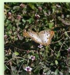
White Peacock on Frogfruit