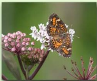
Asclepias Incarnata with butterfly