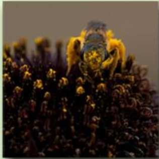
Bee loaded with pollen