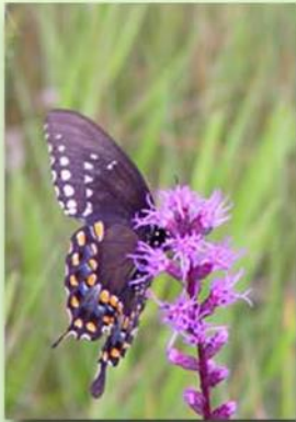
Butterfly on Blazing Star

We will have hundreds of species of Native plants wildflowers, ground covers, shrubs, and trees, (including limited numbers of 3 species of asclepias) that are used by thousands of pollinators in Florida We love our native Bees!