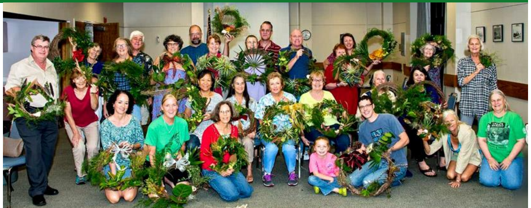
2015 Holiday Wreath Making

Join us for an evening of celebrating the holiday season creating decorations made from native plants and other natural treasures. Supplies will be available but you are welcome to bring in some materials to share. NO GLUE GUNS ALLOWED. More details in the December newsletter.